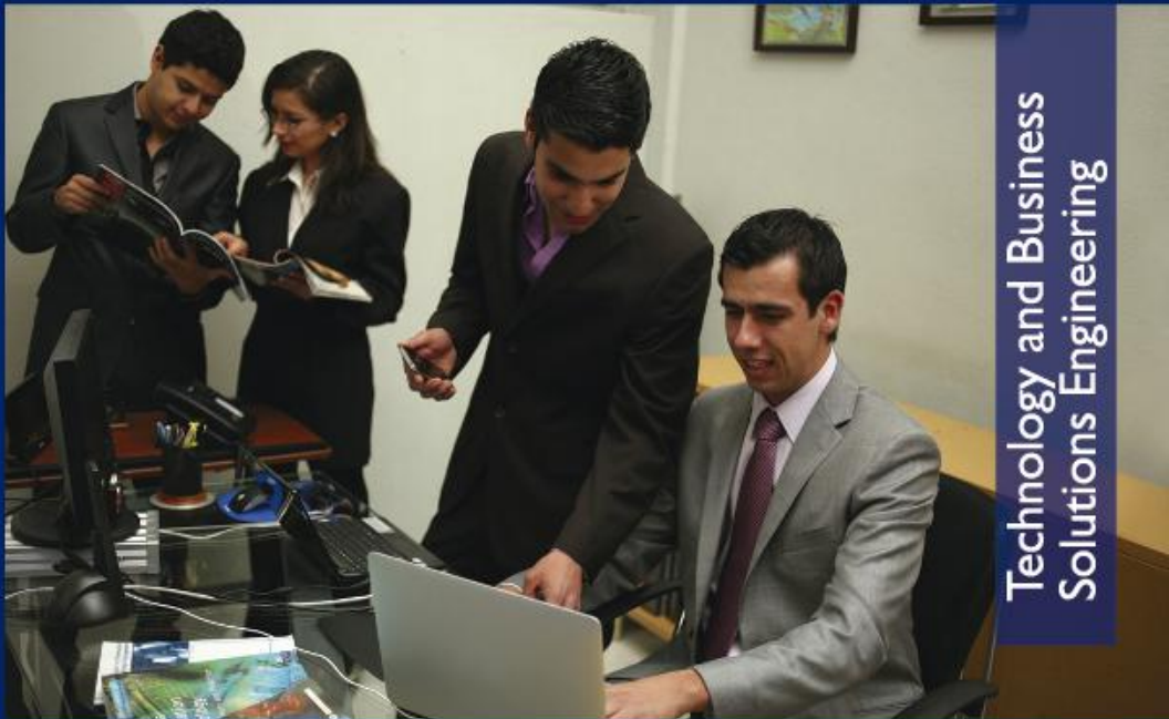
Technology and Business Solutions Engineering