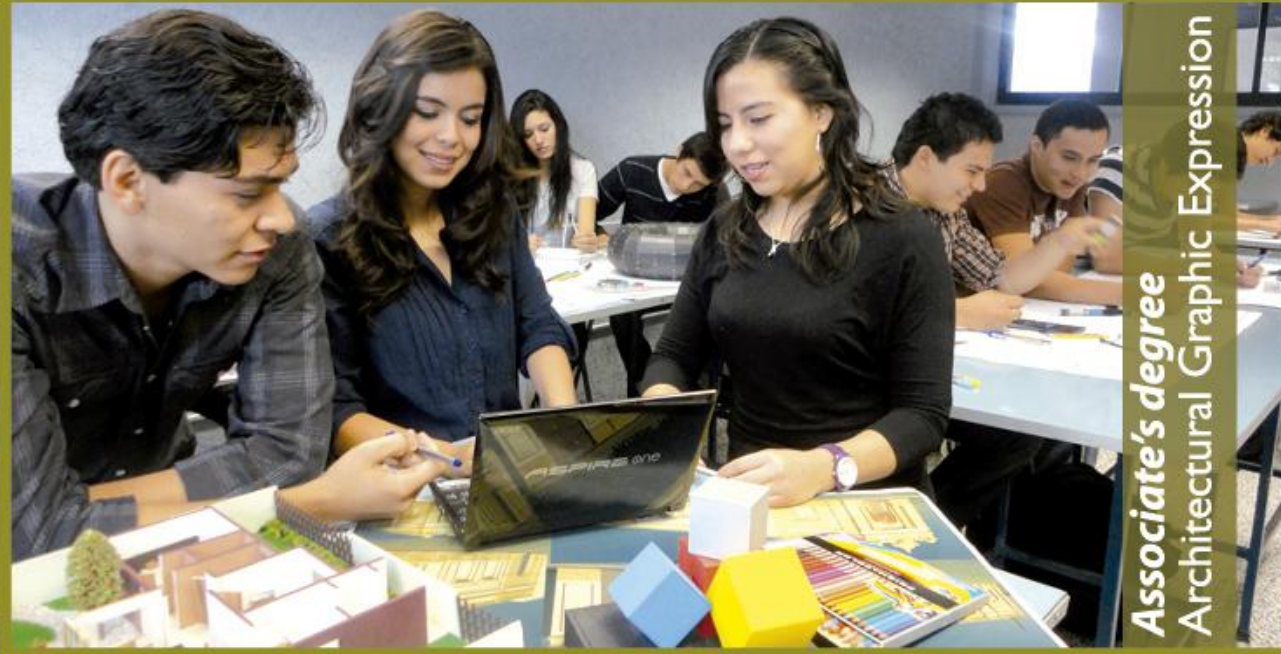
Associate's degree Architectural Graphic Expression