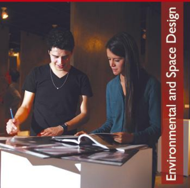
Environmental and Space Design