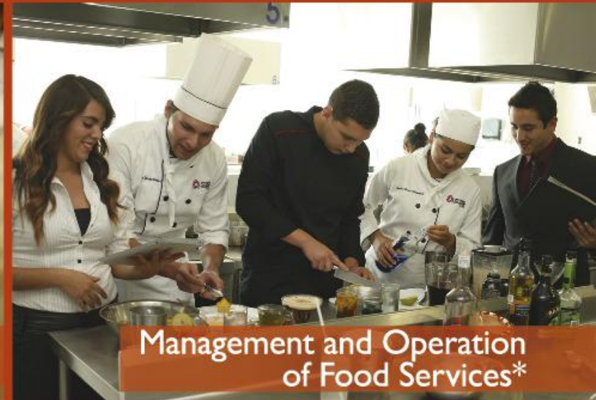
Management and Operation of Food Services*