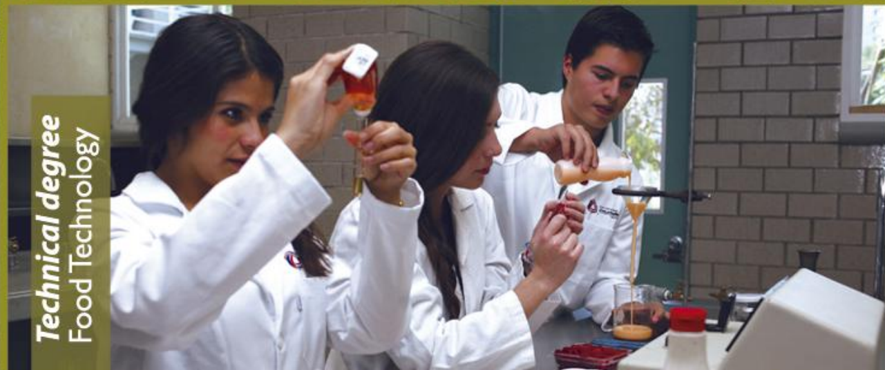
Technical degree Food Technology