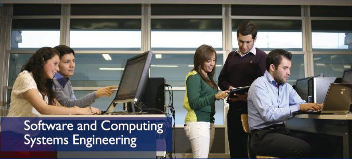
Software and Computing Systems Engineering