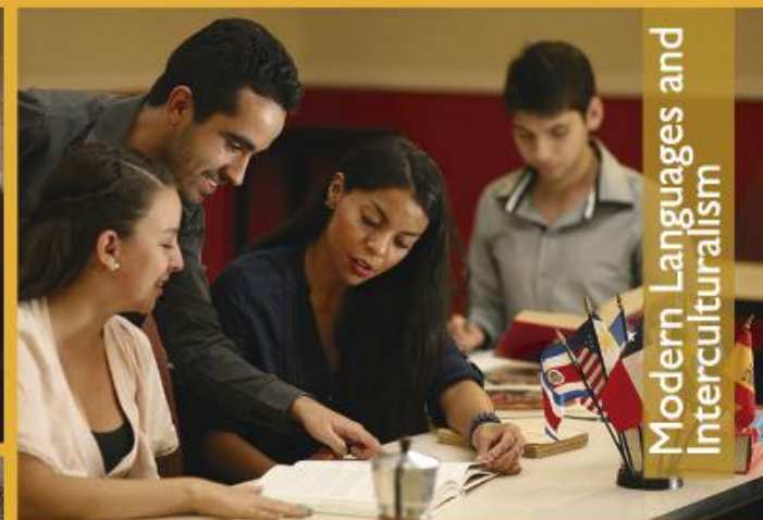
Modern Languages and Interculturalism