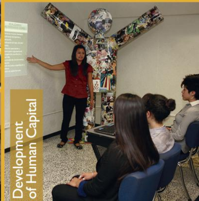
Development of Human Capital