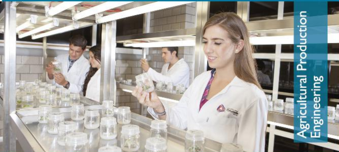
Agricultural Production Engineering