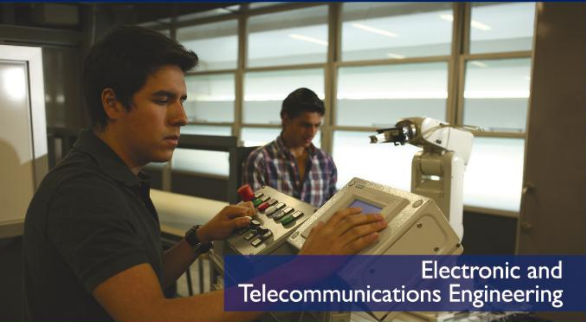
Electronic and Telecommunications Engineering