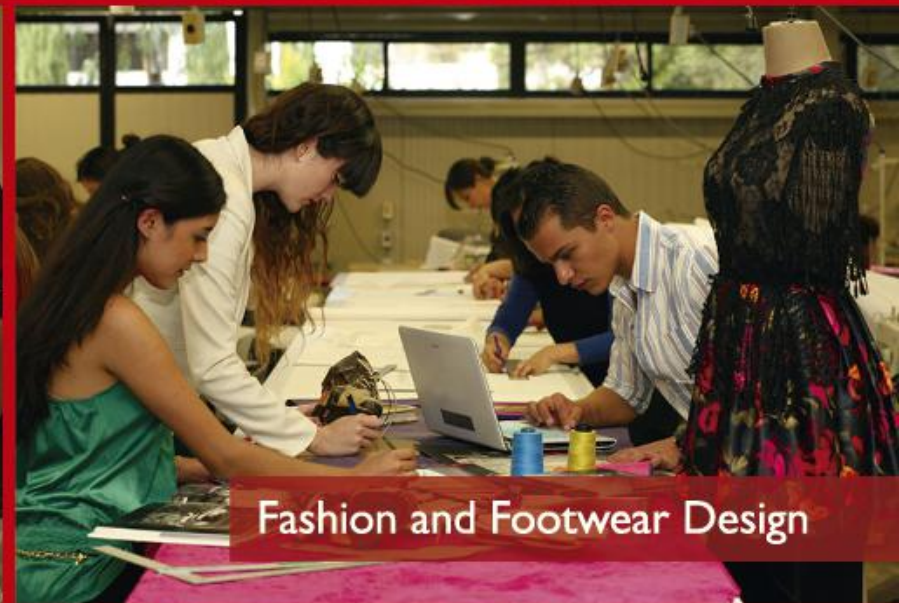
Fashion and Footwear Design