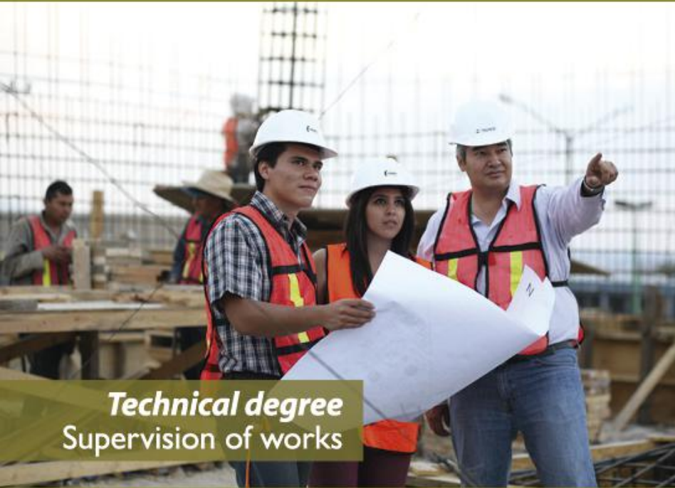
Technical degree Supervision of works