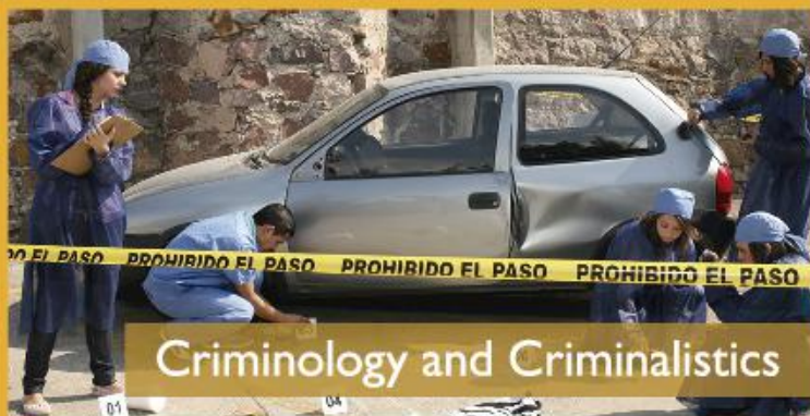
Criminology and Criminalistics