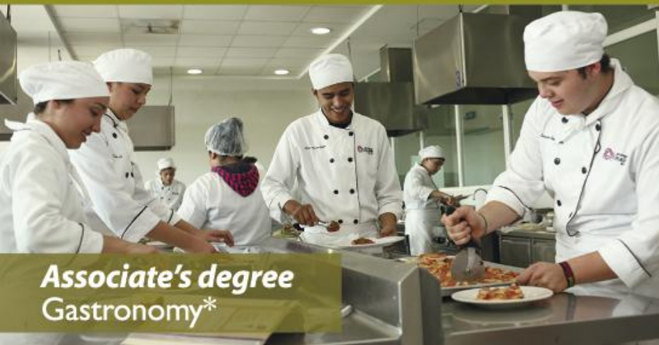
Associate's degree Gastronomy*