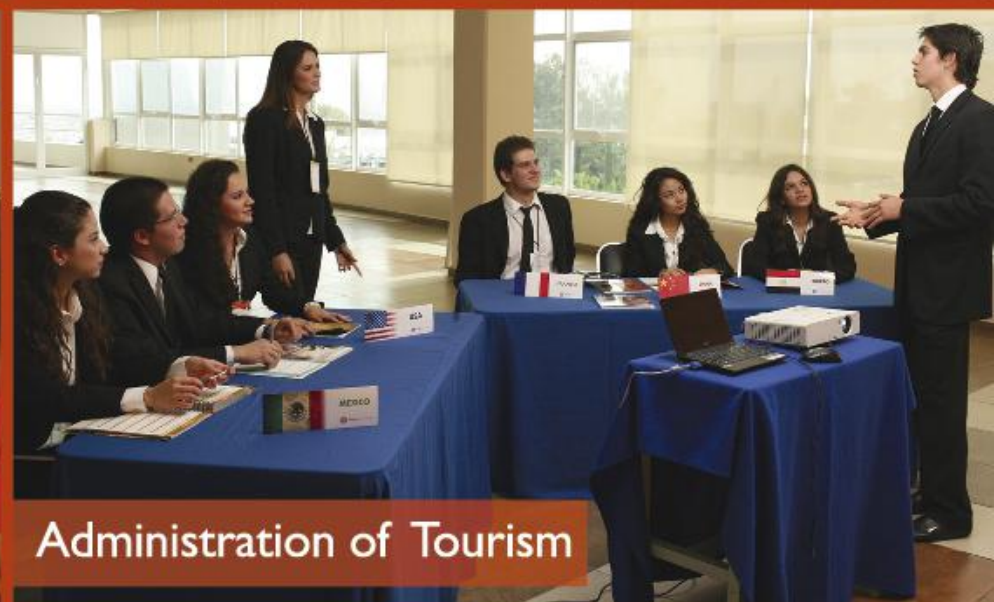
Administration of Tourism